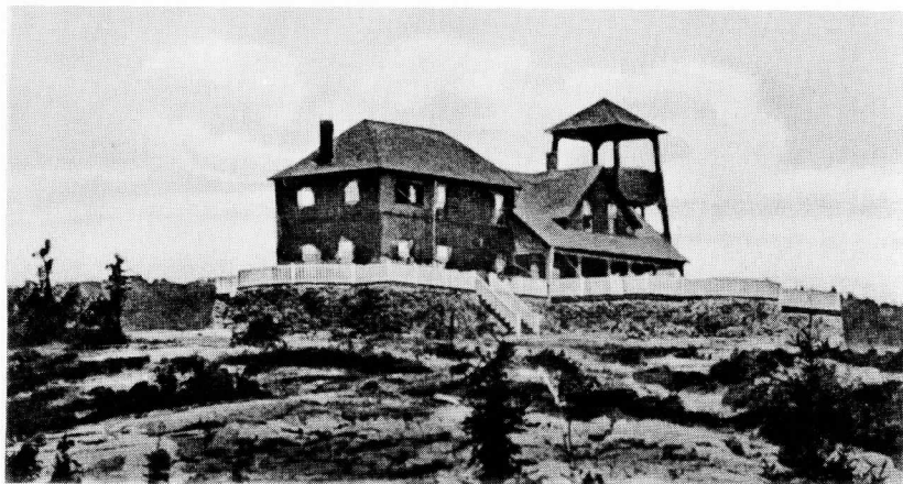
Mt. Battie House, Mt. Battie, Camden.

LAKE, where there is excellent salmon fishing, and WINNECOOK LAKE (Unity Pond), famed for its superior black bass and brown trout.