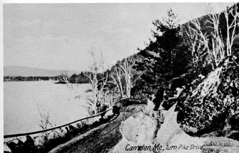
Turnpike Drive, Lake Megunticook, Camden.

In Waldo County, north of Knox County, St. George State Park, in Liberty, was established on LAKE ST. GEORGE. Between Searsport and North Searsport, at QUANTABACOOK LAKE, Ben Ames Williams wrote many of his novels. Close by are SWAN